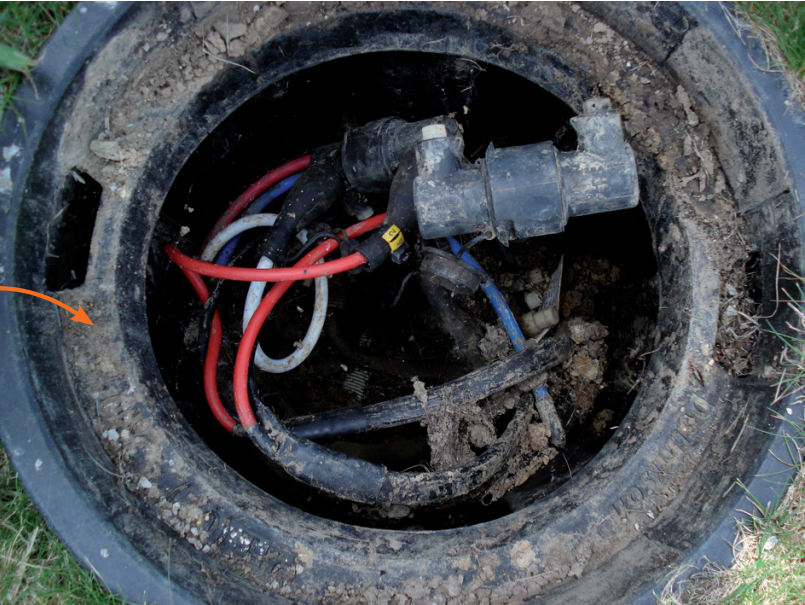
K199 - Installation in a pit

SEE SHEET INSTALLATION / LV insulated toolings